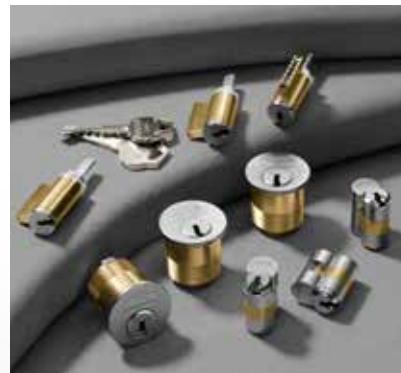
Access 3 Key System