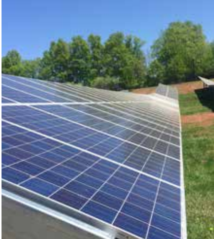
4.1 Acre Solar Farm in Berlin, CT

Finally, as part of ASSA ABLOY's commitment to protect people, places and the planet, Corbin Russwin continues to strengthen its position as a leader in sustainable products and manufacturing.